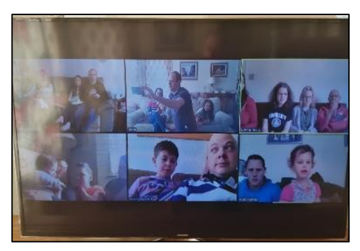
Young people meeting on Zoom

we have not been able to do these things together in person, technology (and paper!) has enabled us to continue our togetherness in the Spirit as we have sung the same songs, prayed the same prayers, listened to the same passages of the Bible being read and reflected on the same sermons each week. The invention of ZOOM has meant we have been able to see and talk to one another for prayer meetings and communion services, for homegroup studies and for Christianity Explored Courses, whilst not been allowed to meet in person. Praise God for technology!