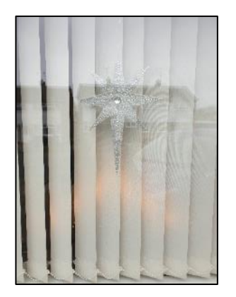
"TO KNOW CHRIST AND TO MAKE HIM KNOWN"