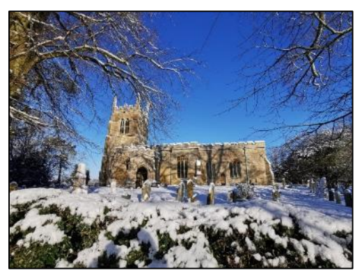
Winter at All Saints