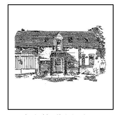
The Stables Christian Centre

The Stables Christian Centre at Bolnhurst has also had a very challenging year. It has been the first time in over thirty years that the doors have been shut to clients and visitors for a significant part of the last year. The Stables is a local Christian charity that we at All Saints support financially and with staff, volunteers and trustees. The charity offers practical working experience to adults on the margins of society, particularly those with learning disability, mental health problems, and ex-offenders. During the pandemic the staff have been amazing and creative, keeping in regular contact with clients by regular calls, emails, zoom and the slick production of monthly videos on Youtube to keep everybody in touch.